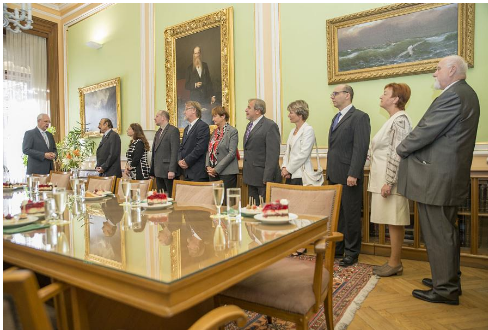
Figure I. Prof. Zimbardo received the highest award of the Czech Academy of Sciences.

Upcoming World Psychological Forum is planned for 2017 and will be held in Brno, Czech Republic. More information will be announced by UPA and CMPS.